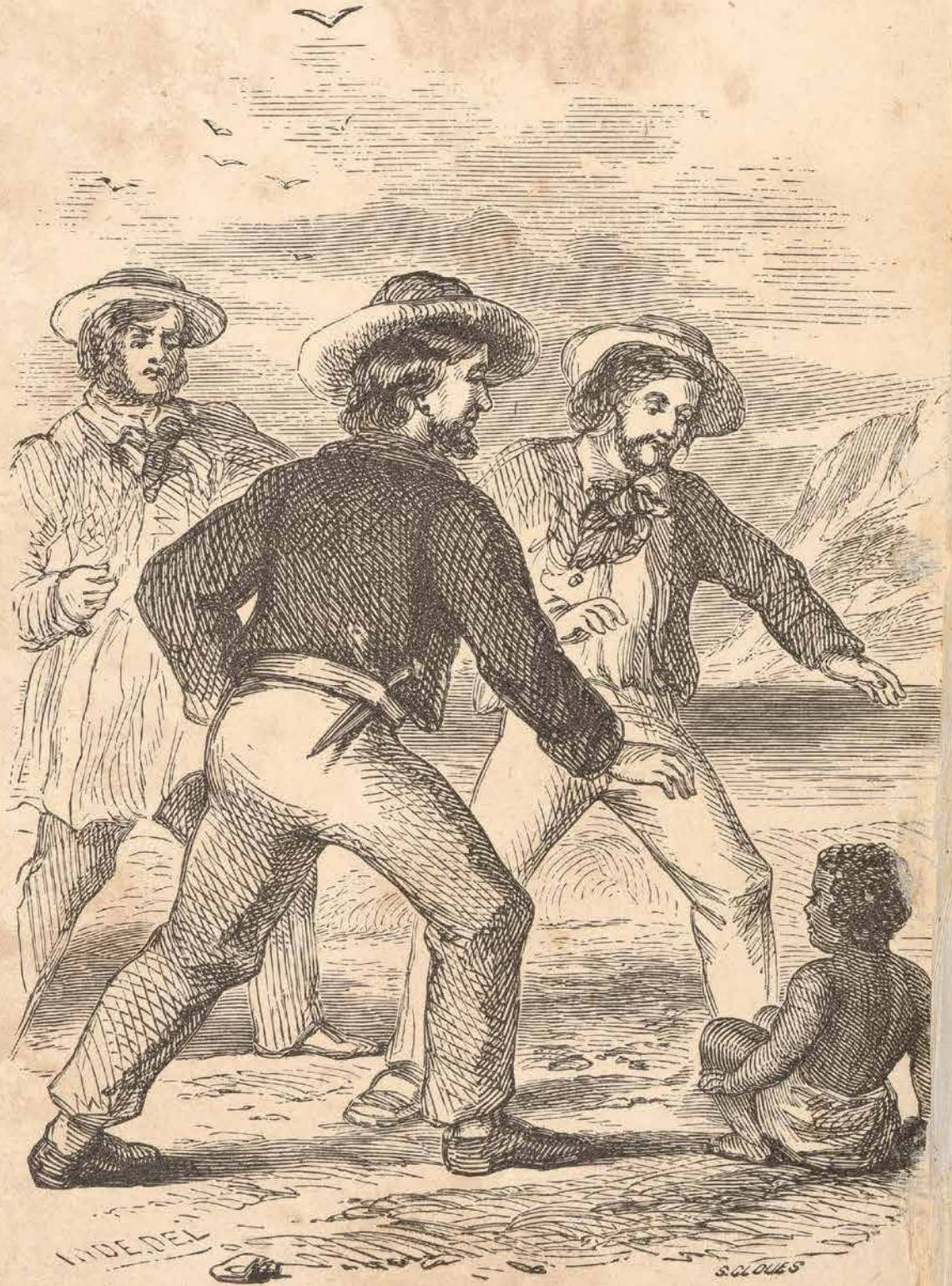
THE THEFT.—Page 12.