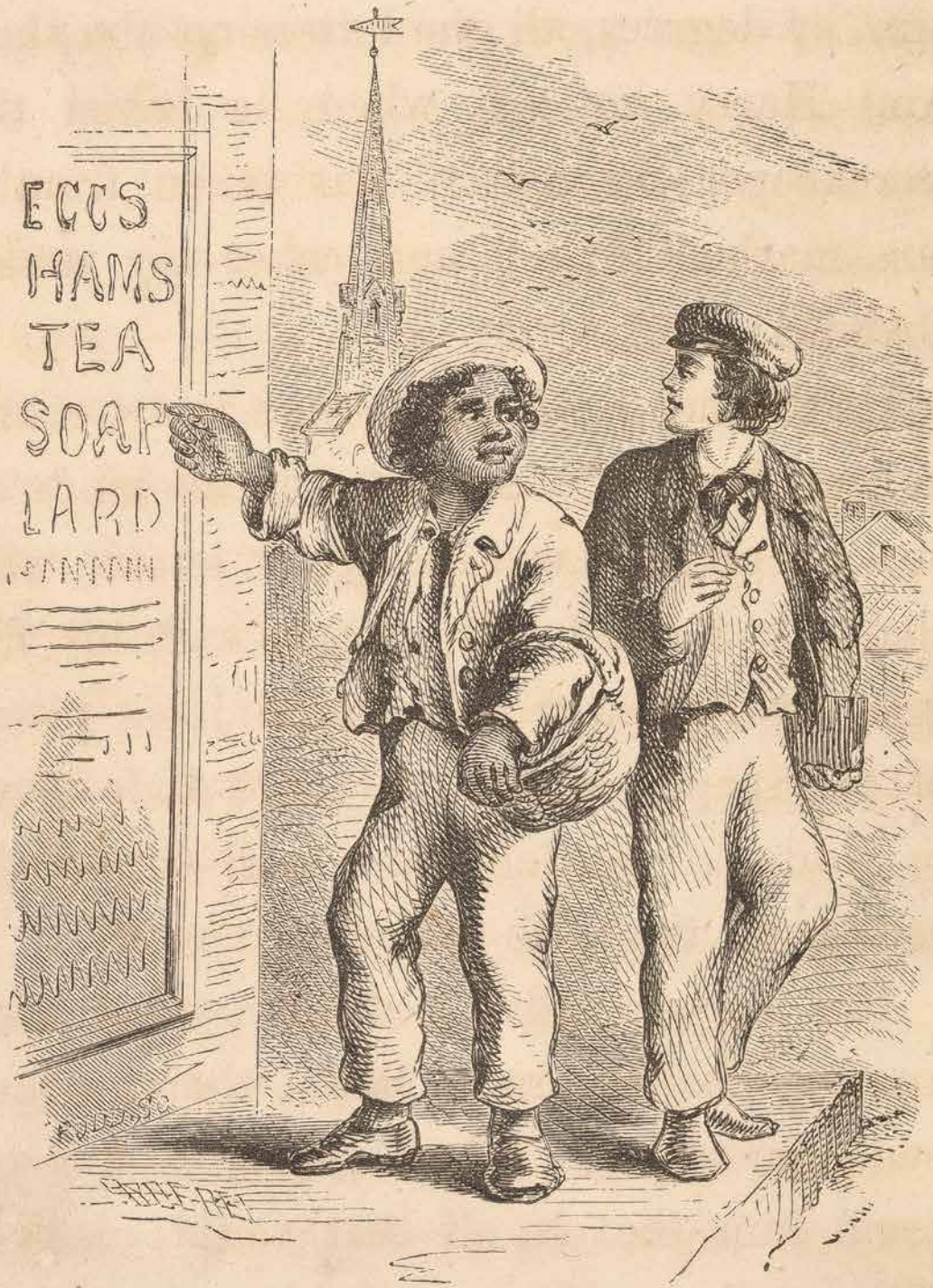
LEARNING TO READ.