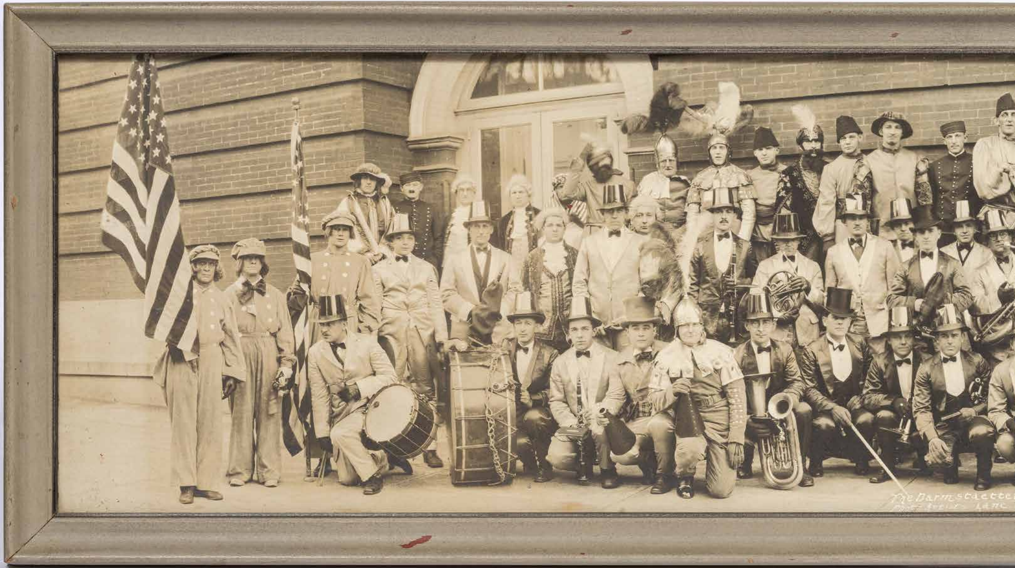
The Darmstaetter's FIRST BAND - 1880