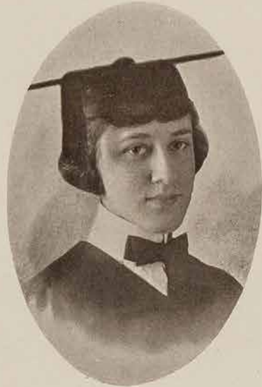
B. L. Δ E