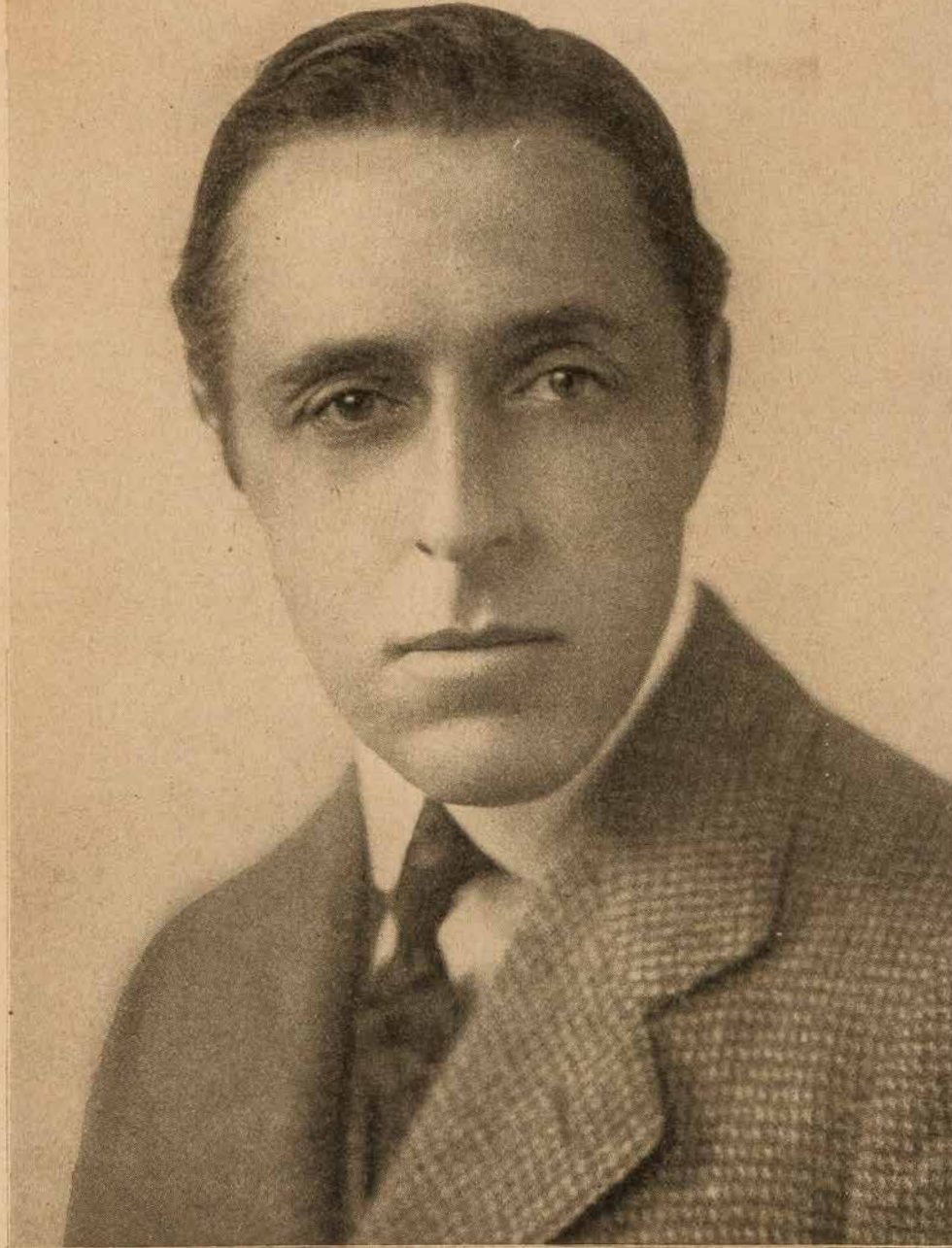
DAVID WARK GRIFFITH

First edition. Small quarto. [108]pp. Illustrated from photographs. Illustrated paper wrappers. Small tear along the paper spine, tiny nick on front fly, very near fine. Over 100 portraits of silent film stars with biographical sketches including Billie Burke, D.W. Griffith, Dorothy Gish, Lillian Gish, Thomas Ince, Norma Talmadge, Mabel Normand, Fatty Arbuckle, William S. Hart, Mae Marsh, Cecil B. De Mille, Pearl White, Douglas Fairbanks, Mary Pickford, Francis X. Bushman, Charlie Chaplin, Theda Bara, and many others. Scarce. [BTC#424823]