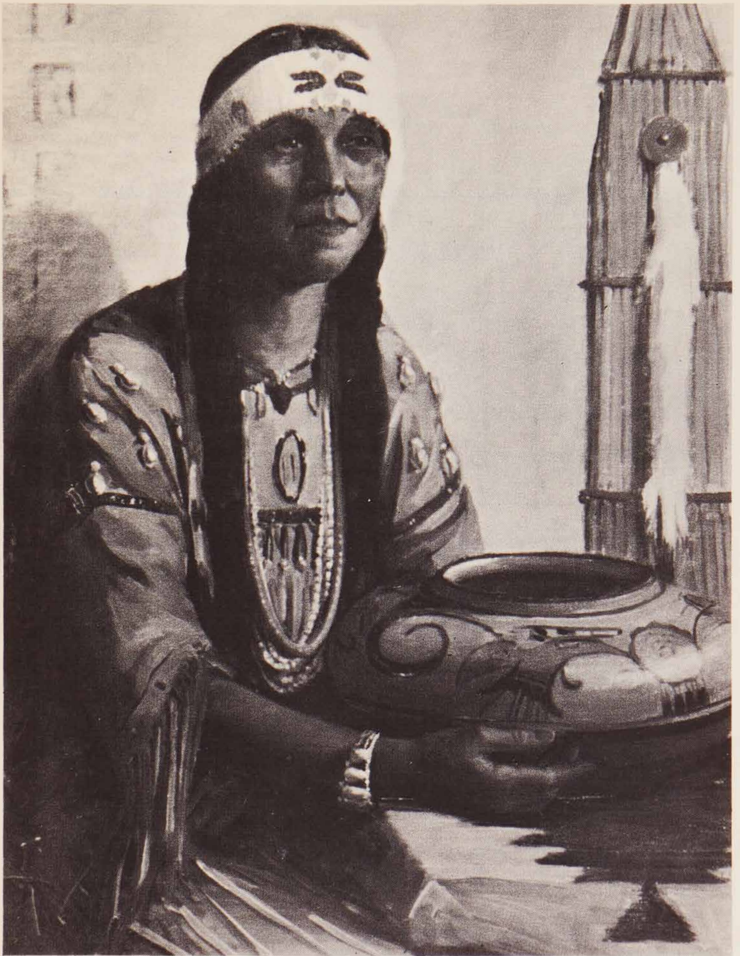
Tsianina Blackstone – Portrait in oil