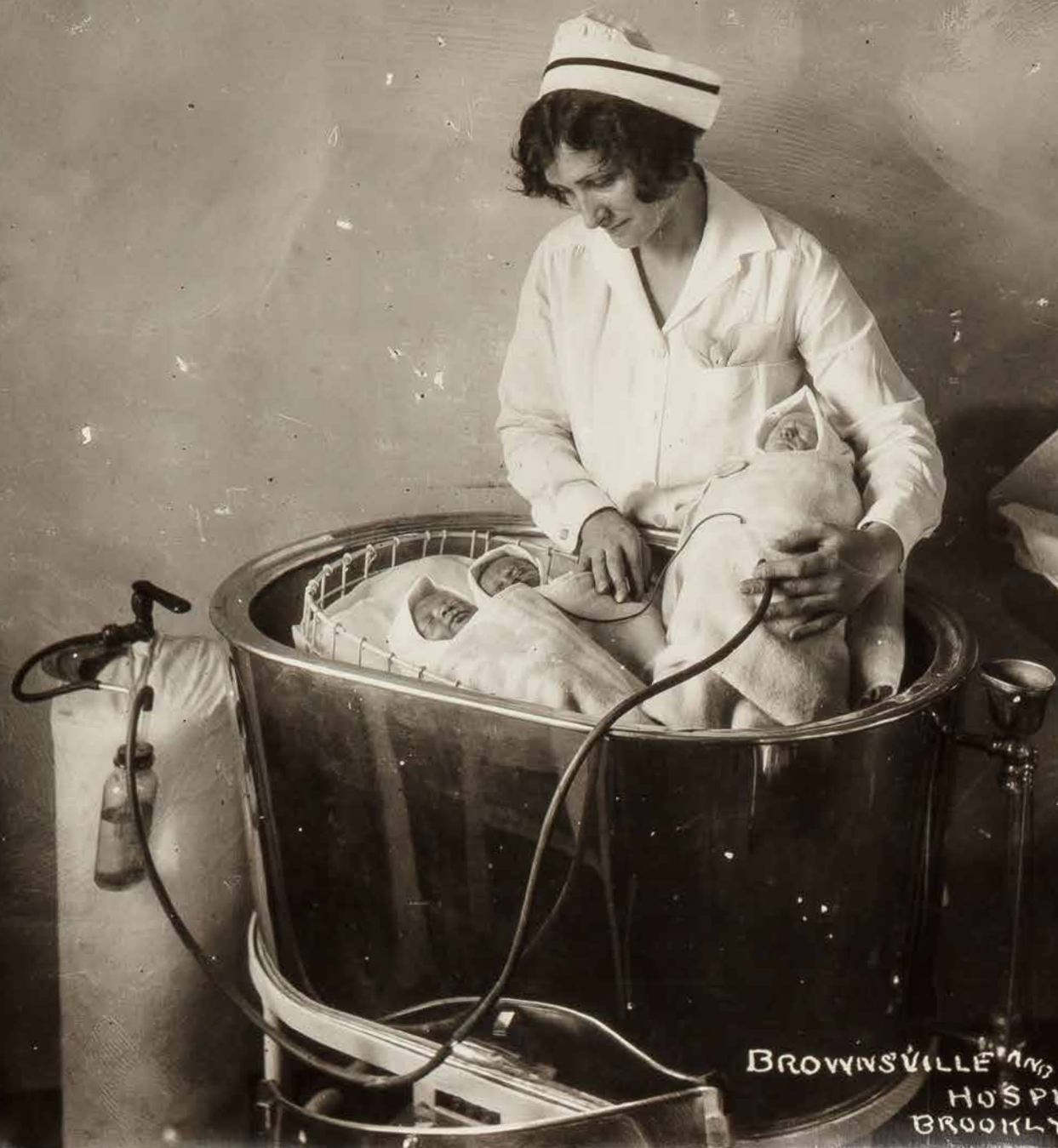
BROWNSVILLE AND EAST NEW YORK HOSPITAL BROOKLYN N.Y.