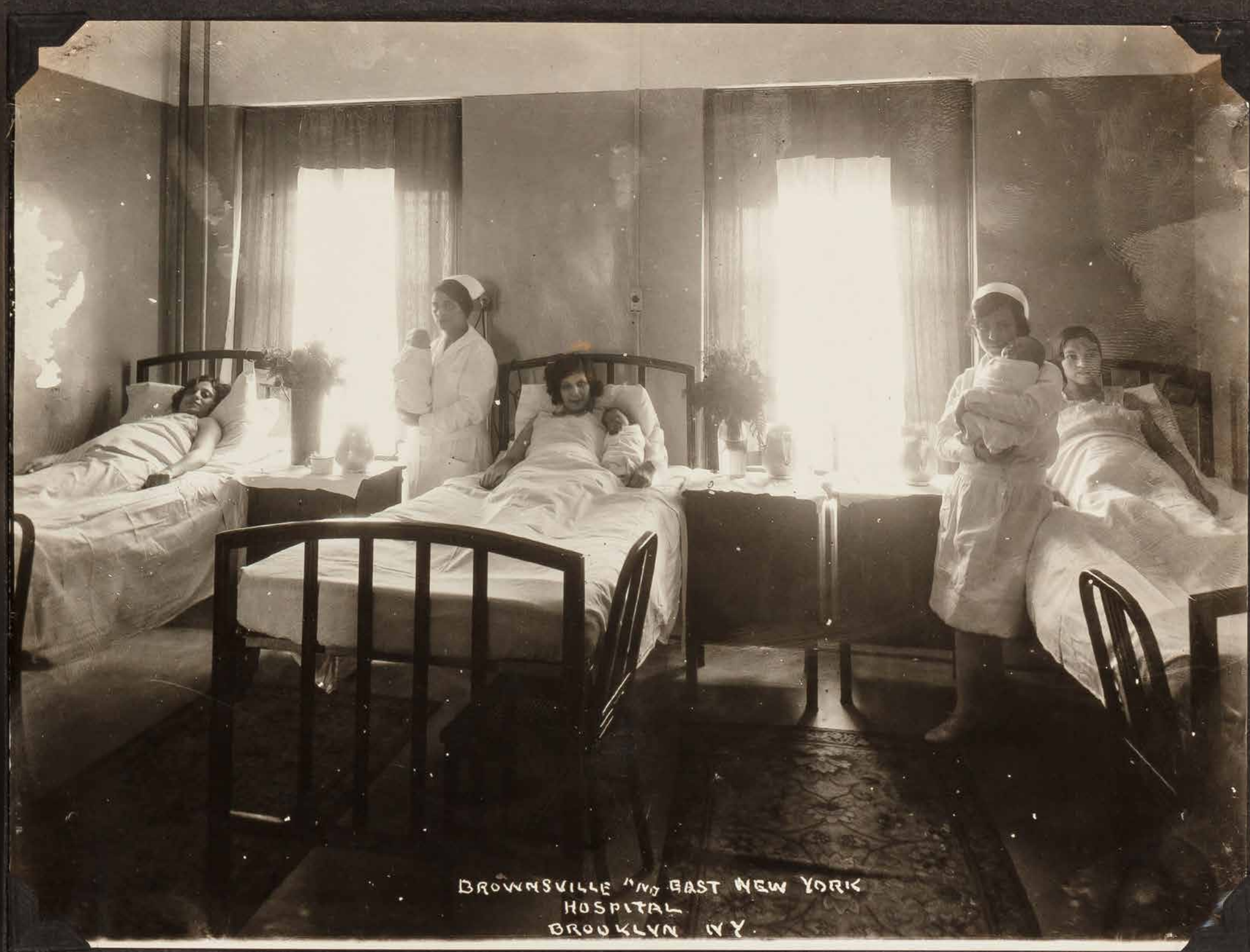
BROWNSVILLE "NY EAST NEW YORK HOSPITAL BROOKLYN NY