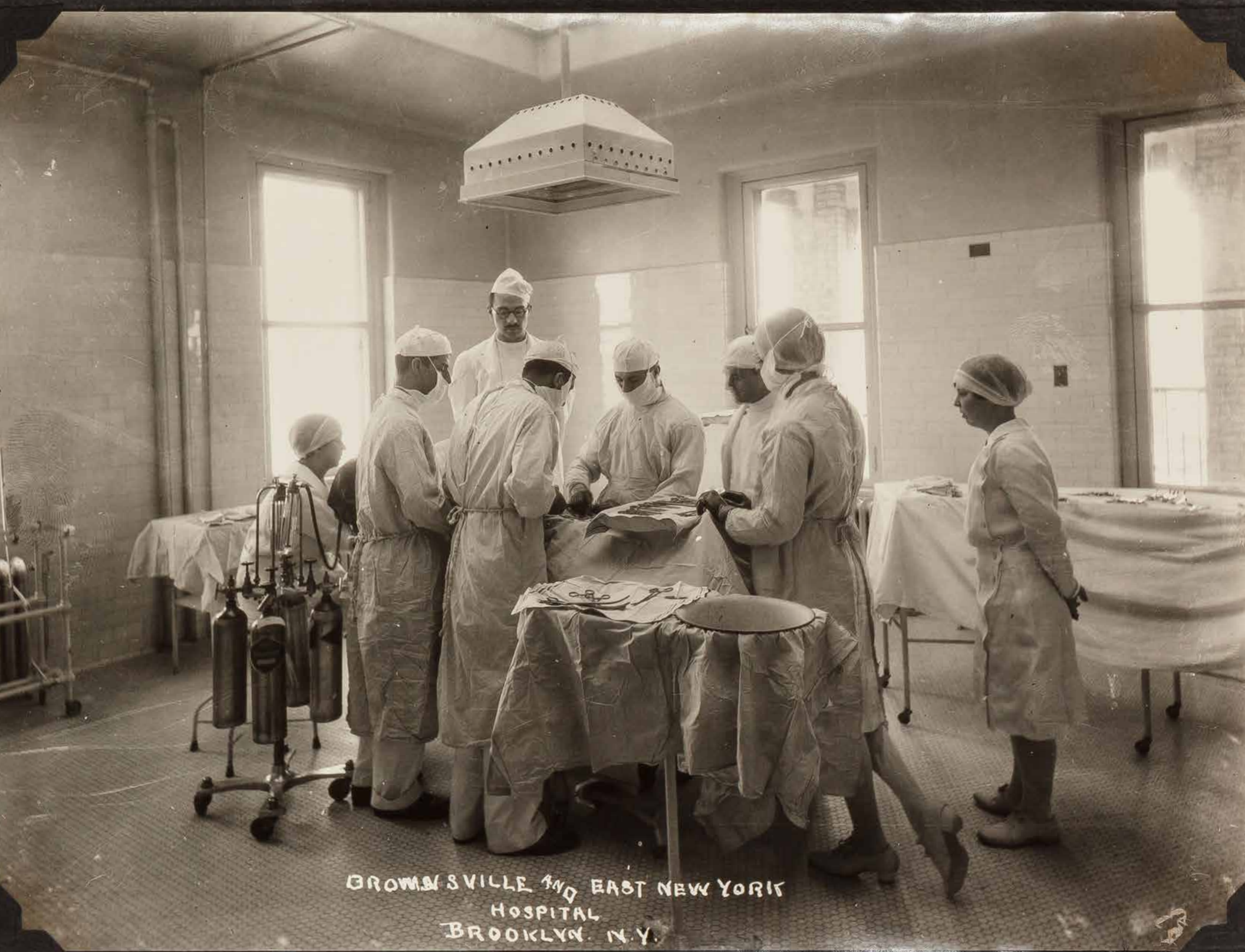
BROOKLYN AND EAST NEW YORK HOSPITAL BROOKLYN, N.Y.