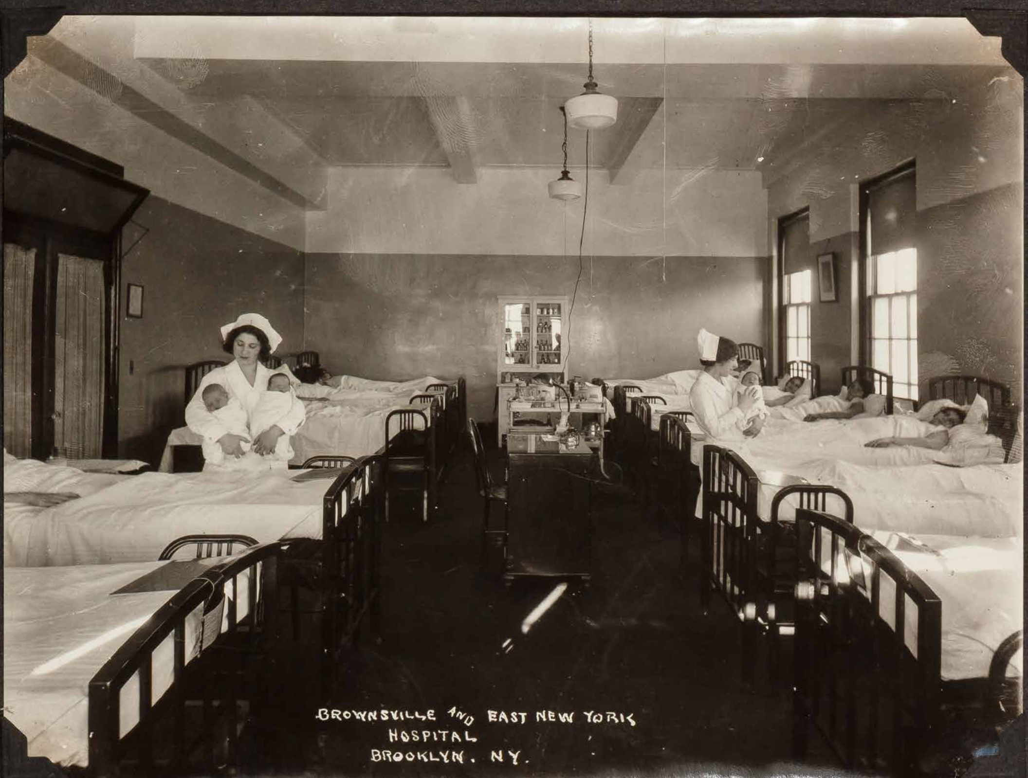
BROWNSVILLE AND EAST NEW YORK HOSPITAL BROOKLYN, N.Y.