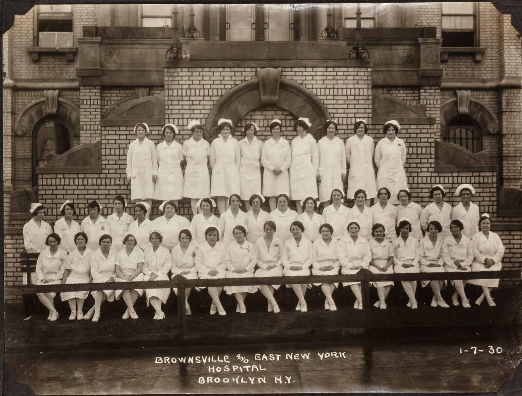
BROWNSVILLE AND EAST NEW YORK HOSPITAL BROOKLYN N.Y.