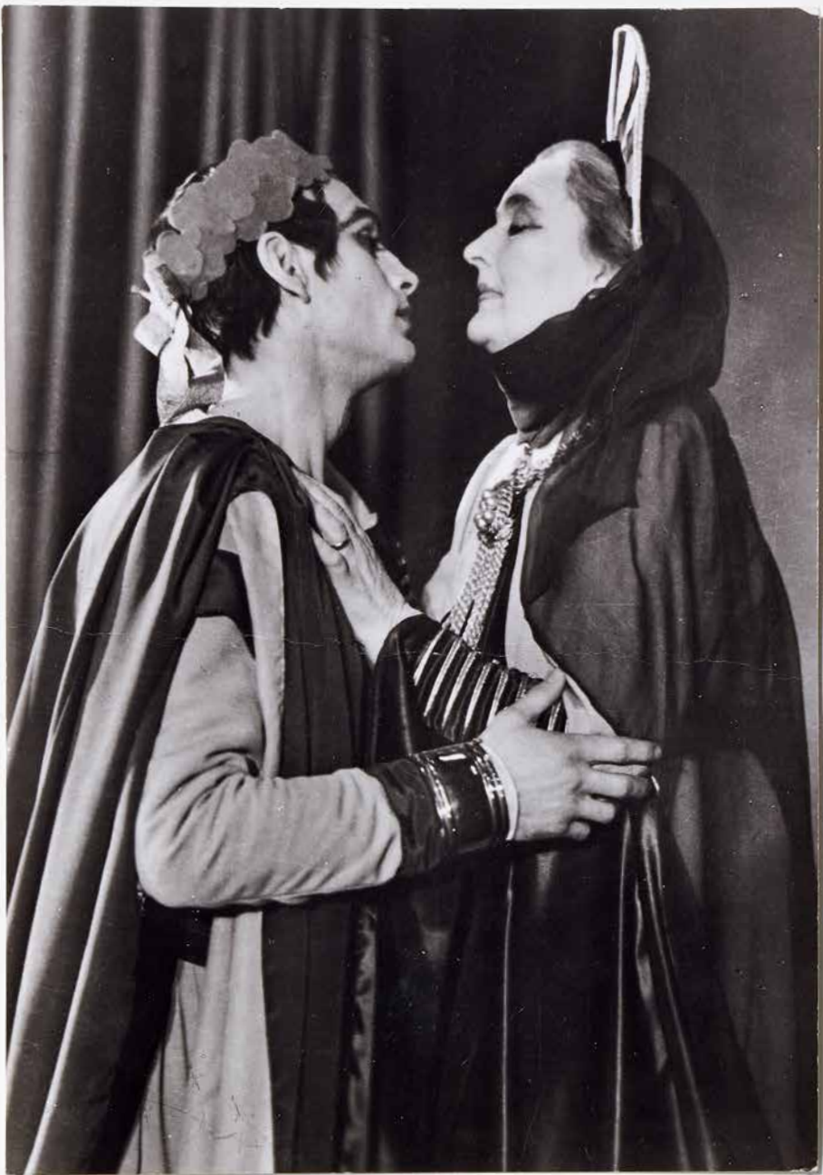
Sybil Thorndike as Volumnia, Laurence Olivier as Coriolanus in 'Coriolanus' by William Shakespeare Old Vic Theatre, 1938

Love to you darling your Sybil Larry & Sybil