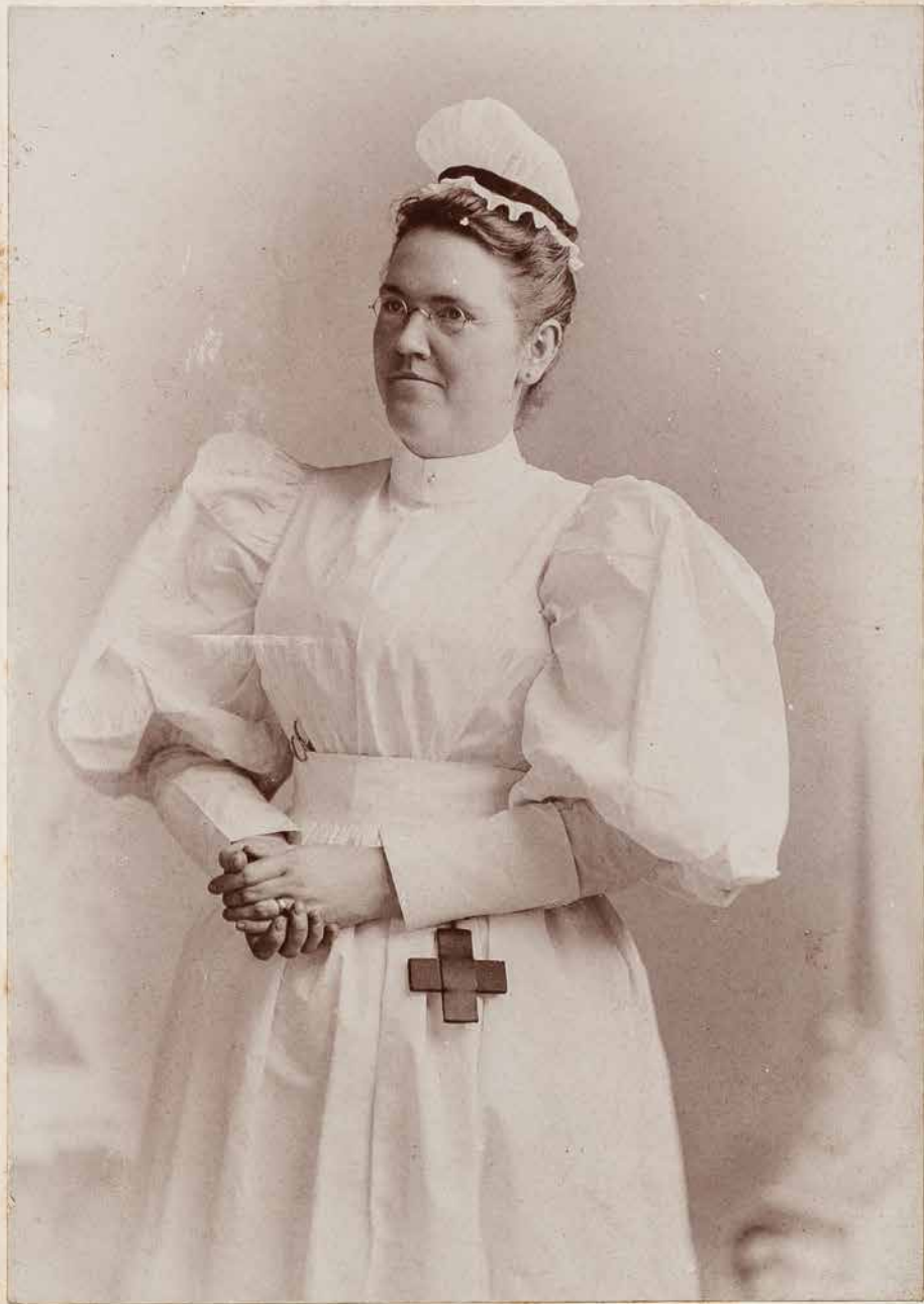
SEABURY, - 17 Pleasant St., Malden.