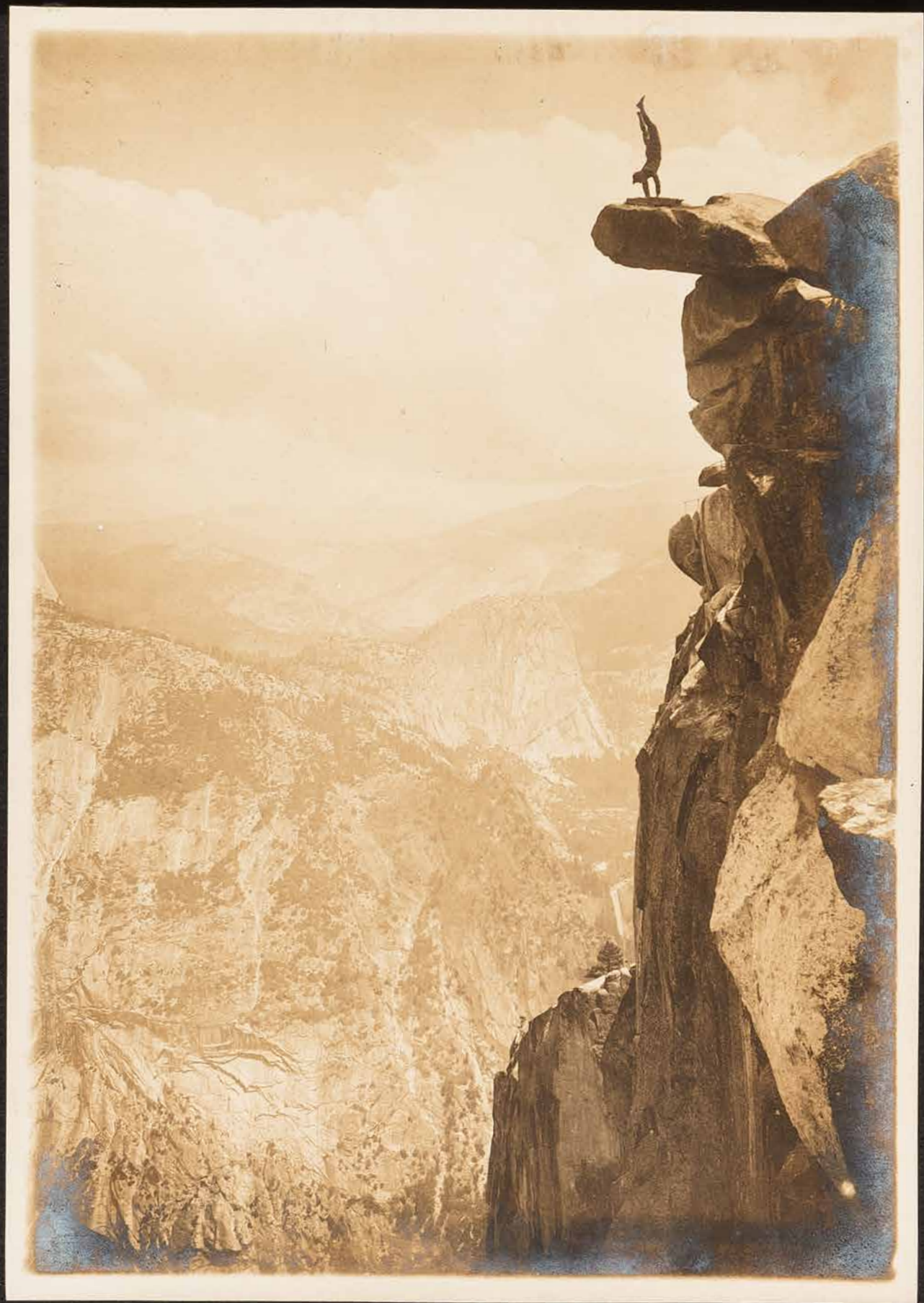
GLACIER POINT 3265 FT.