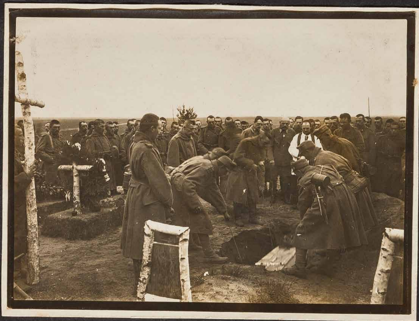
Podvrat na ruske frontě