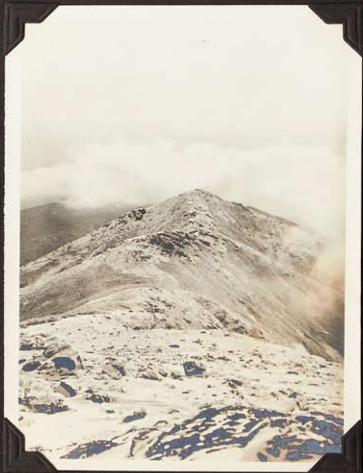
Mt. Liberty from Mt. Lafayette