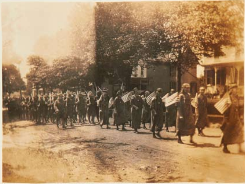
co e. 4 th . Reg, n. f. n. g.