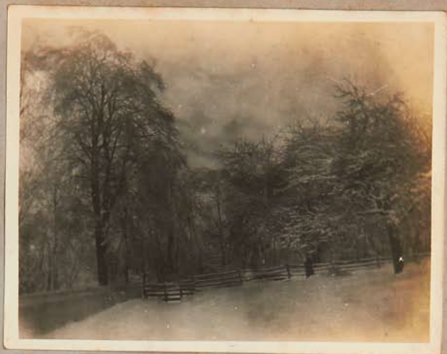
Ice storm 1915.