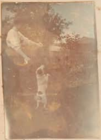
B. A. - 1361