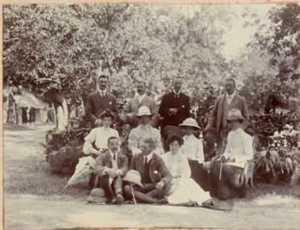
Polo Ground and Bell room.