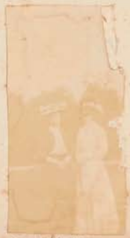
Aunt Alice - 1361