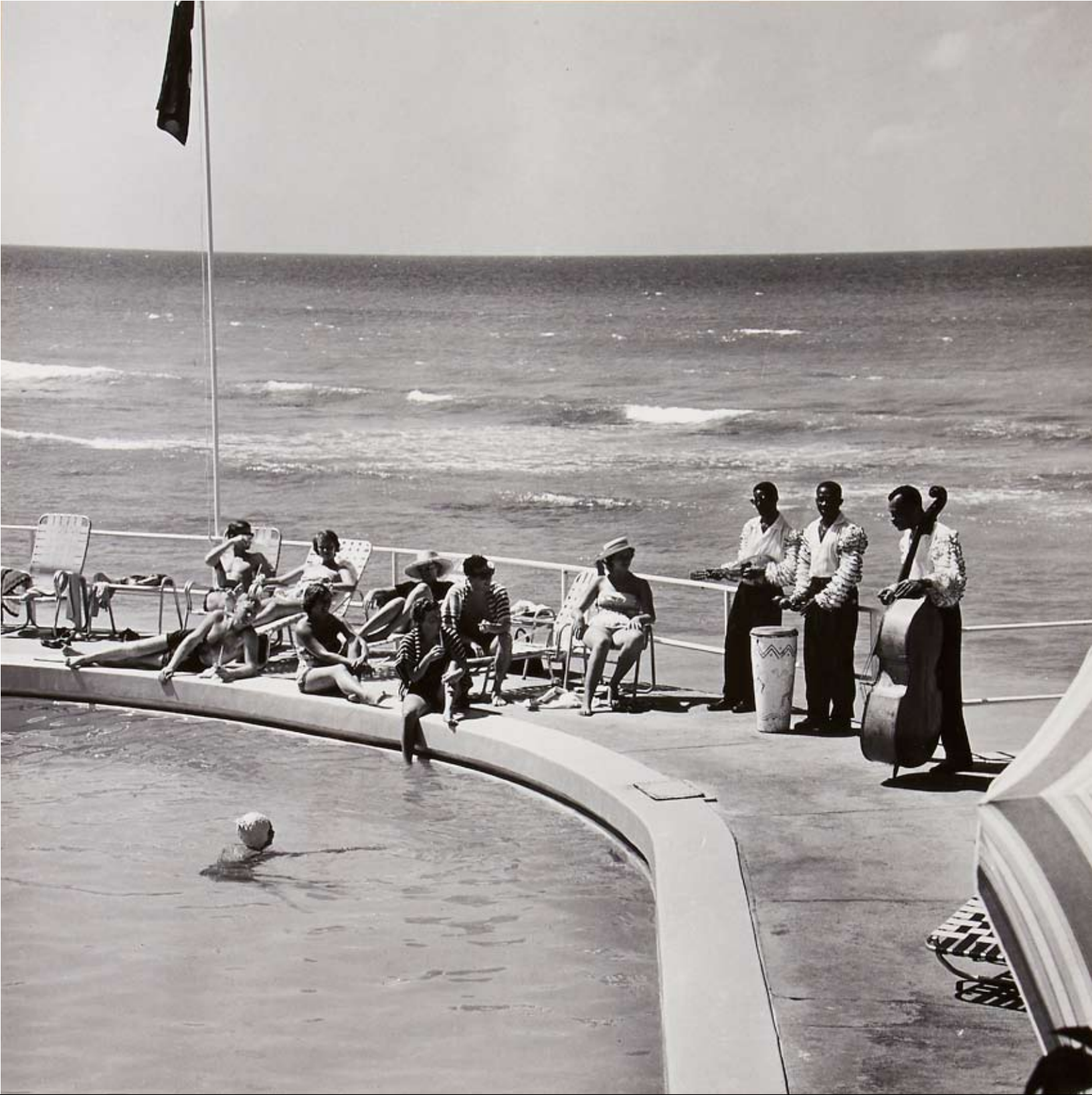
Pictures centered around a luxurious vacation in Jamaica in the mid-to-late 1950s, several of the images set at the San Souci resort. The images feature attractive looking vacation-goers drinking around a pool or walking on the beach, shopping, a pool side Caribbean-style band, rafting, a few harbor and fishing village images, workers harvesting sugar cane, workers hauling banana by oxen, natives working on woven rugs and hats, and other pictures of both vacationers and indigenous people working. We know little about the photographer George Hunter other than he was obviously professional or very accomplished. A slick but pleasing view of Jamaica as a vacation spot. [BTC#401985]