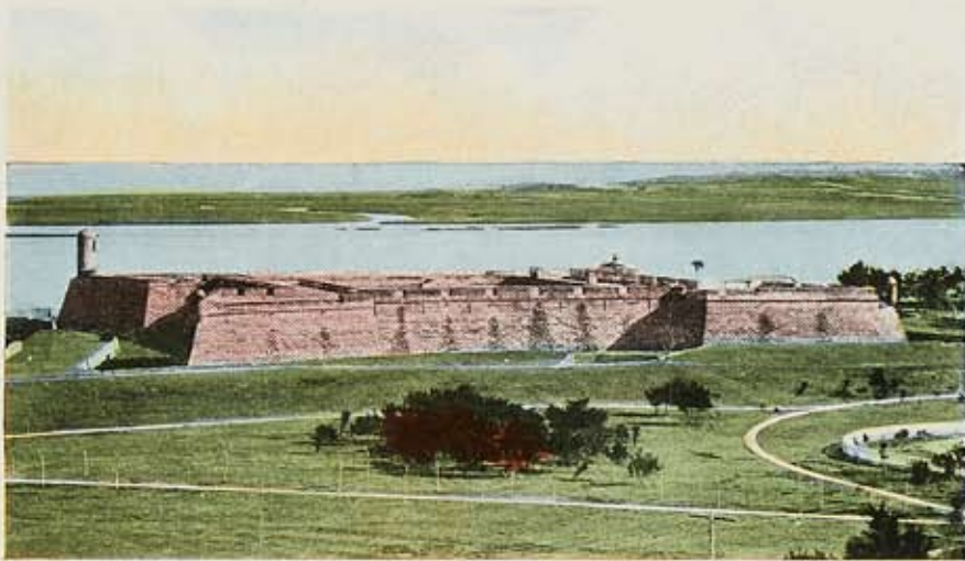
1370 FORT MARION, ST. AUGUSTINE FLA. THREE AND A HALF CENTURIES OLD