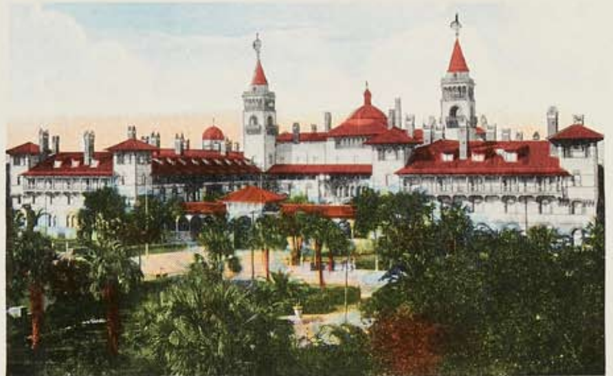
1371 HOTEL PONCE DE LEON, ST. AUGUSTINE, FLA.