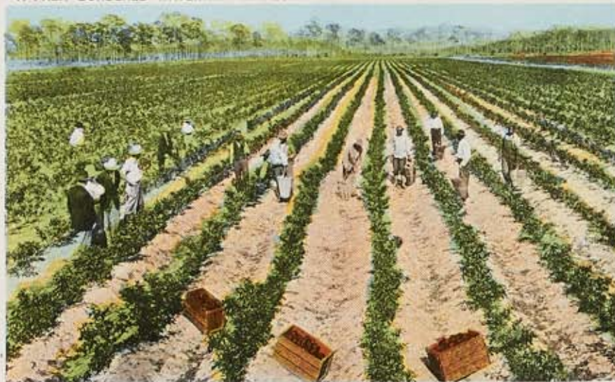
1319 PEPPER FIELD, SOUTHERN FLORIDA.