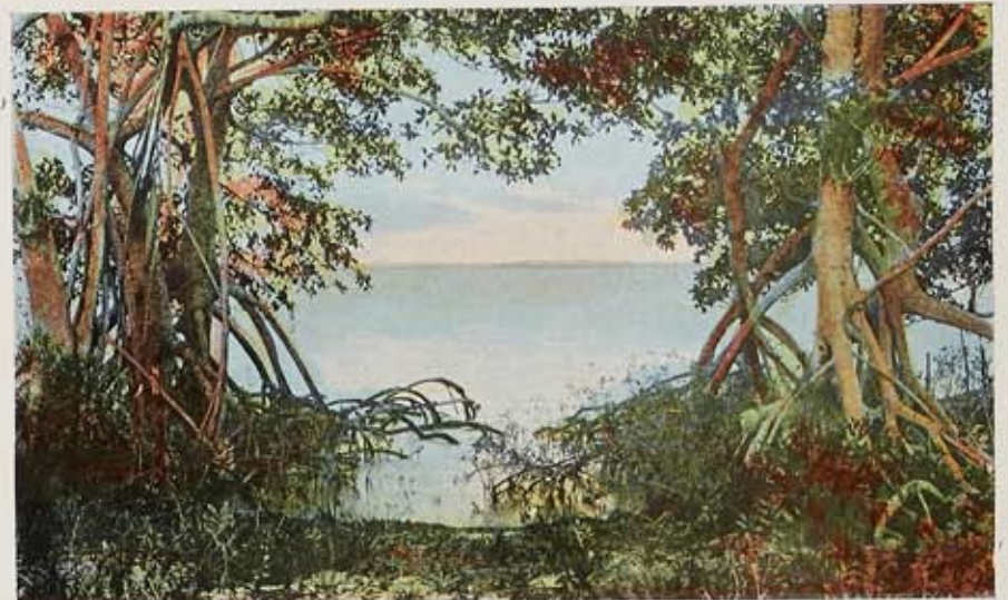
1216 MANGROVES, COCOANUT GROVE, NEAR MIAMI, FLA.