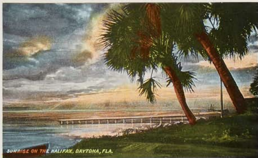
SUNRISE ON THE HALIFAX, DAYTONA, FLA.