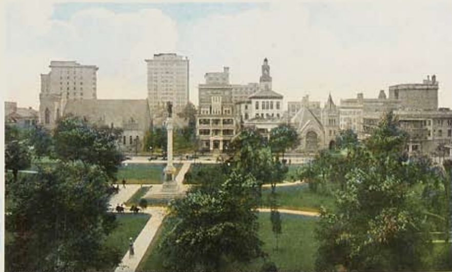
1397—HEMMING PARK AND SKYSCRAPERS, JACKSONVILLE, FLA.