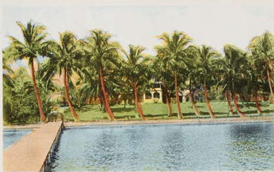
A PALM BORDERED WATERWAY IN FLORIDA