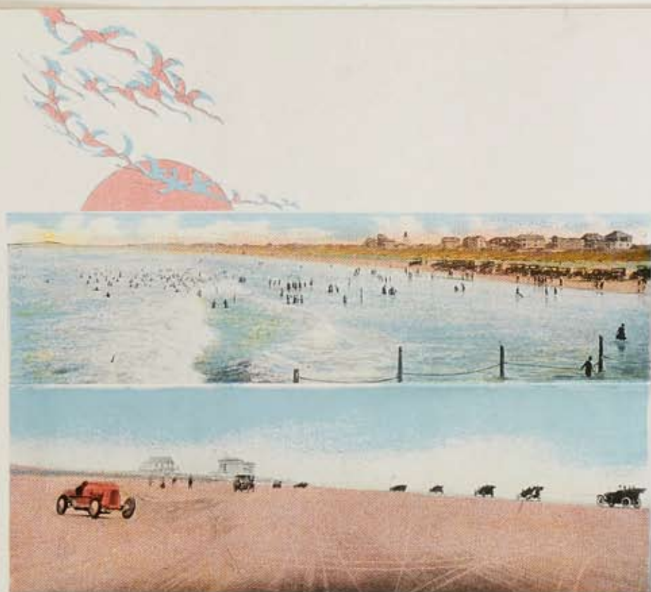
DAYTONA BEACH AT HIGH TIDE (ABOVE) AND LOW TIDE (BELOW). - AT LOW TIDE THE BEACH IS 500 FT. WIDE. THE WORLD'S GREATEST MOTOR SPEEDWAY IN THE WORLD WHERE A SPEED IS ATTAINED OF 3 MILES A MINUTE