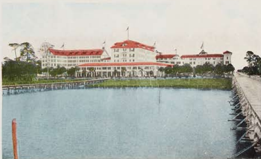
1306 ORMAND HOTEL. ORMAND BEACH FLA.