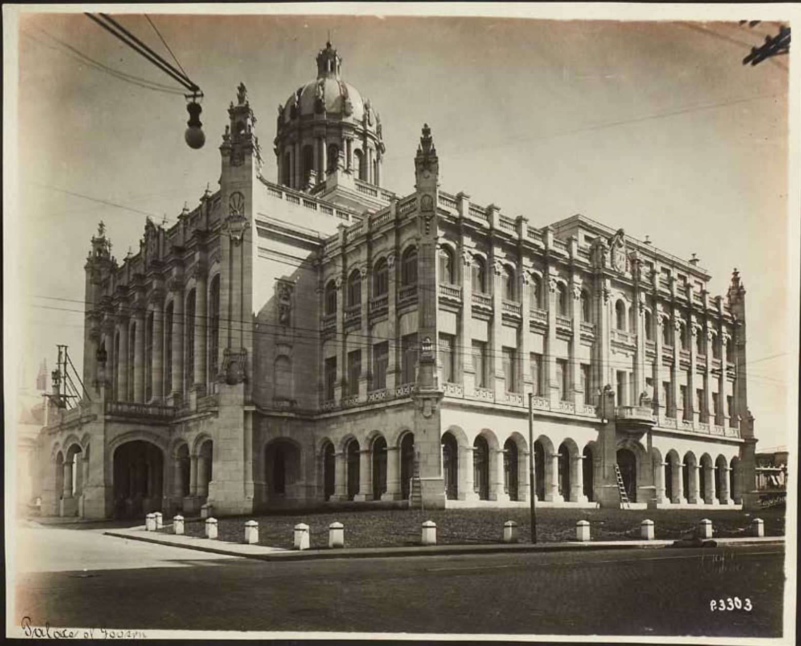
Palace of Justice