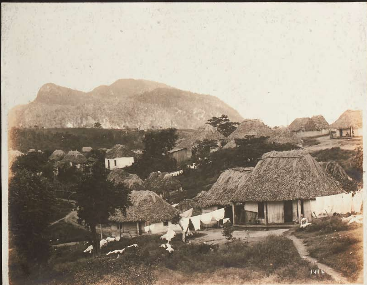
Country town, Pinar del Rio.