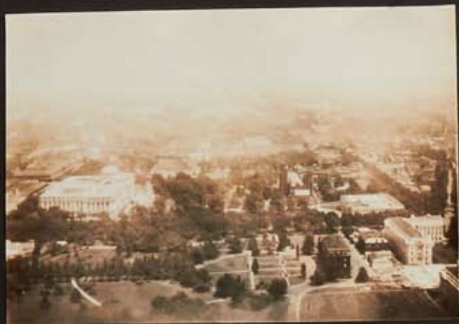
CAPITOL FROM MONUMENT