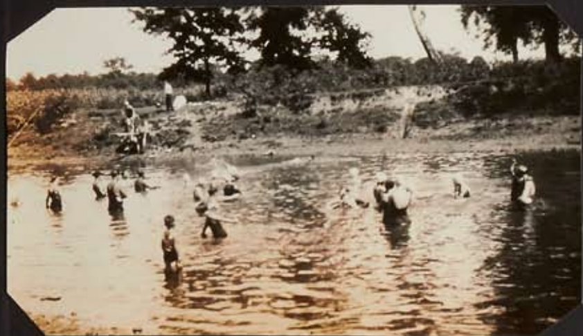
LOOKING TOWARD CAMP