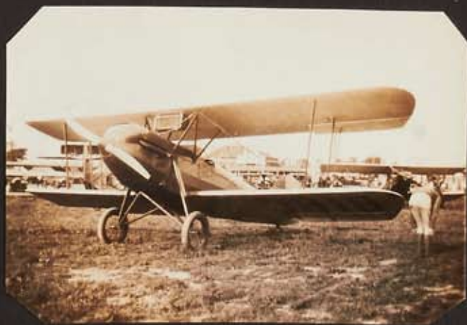
PLANE WE WENT UP IN. GOOD YEAR VIEW OF BURCH