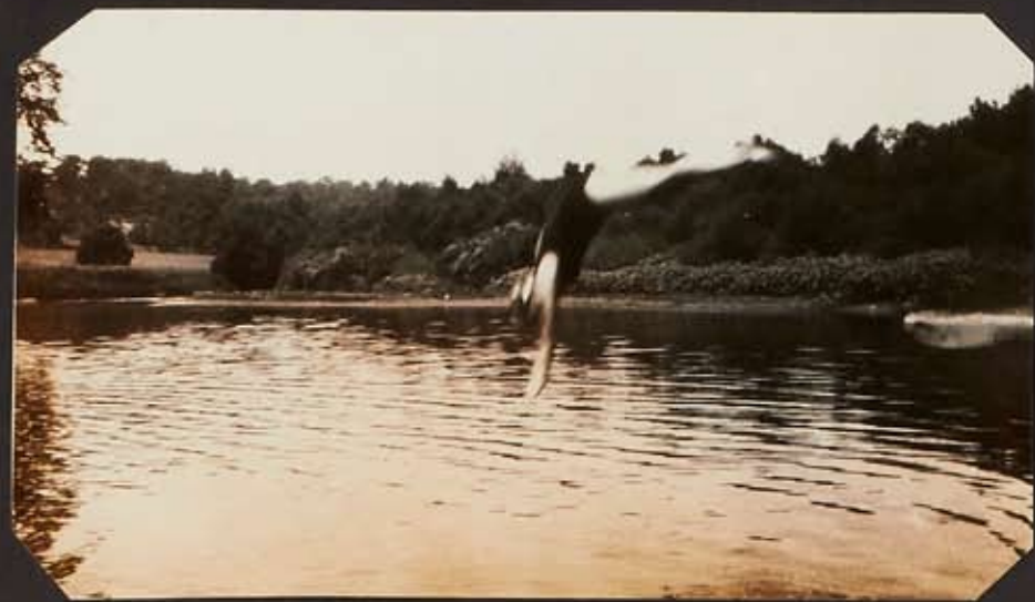
THREE VIEWS OF MARTINA DIVING