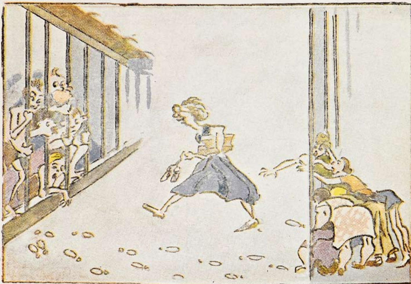
"The Missing Link"