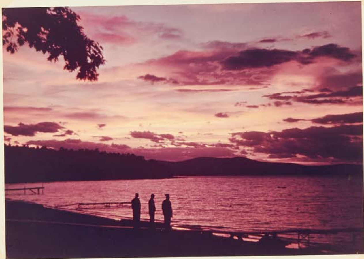
Day is Done