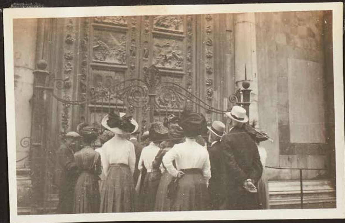
Doors of the Baptistery, July 16.