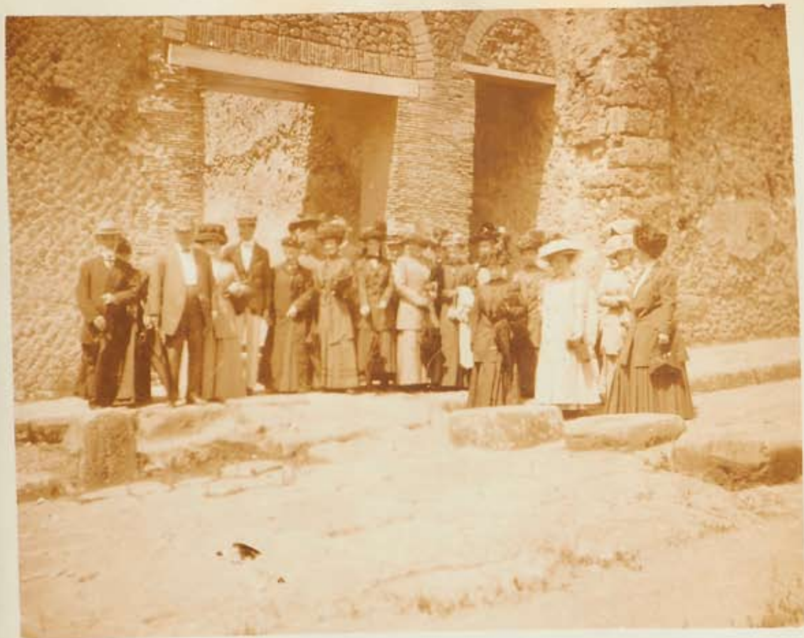
Down at Pompeii on Street