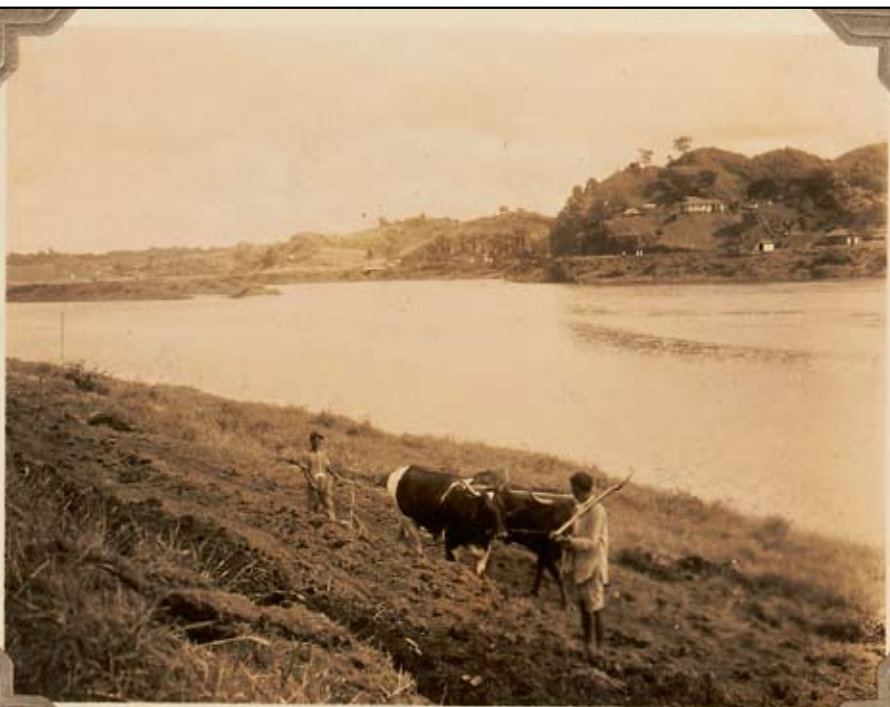
Draught oxen : Rewa River