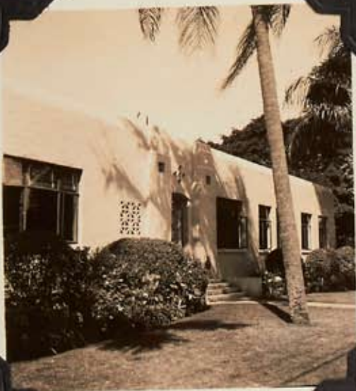
Dept. of Agriculture.