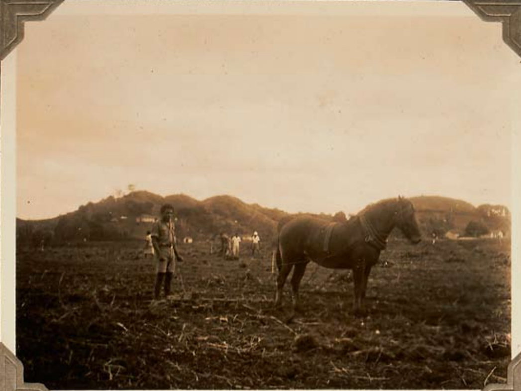
Nendutulele : ploughing.