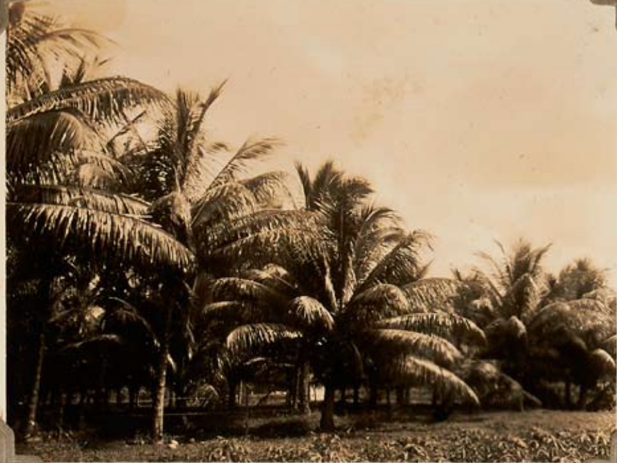
Nanderululu : Malayan dwarfs. 16.8.37.