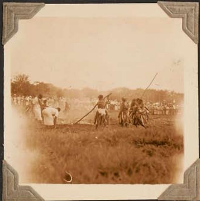
Natives of Mbengga: Fire walking display in Albert Park.