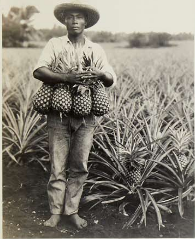
Native Boy - Pineapple Plantation