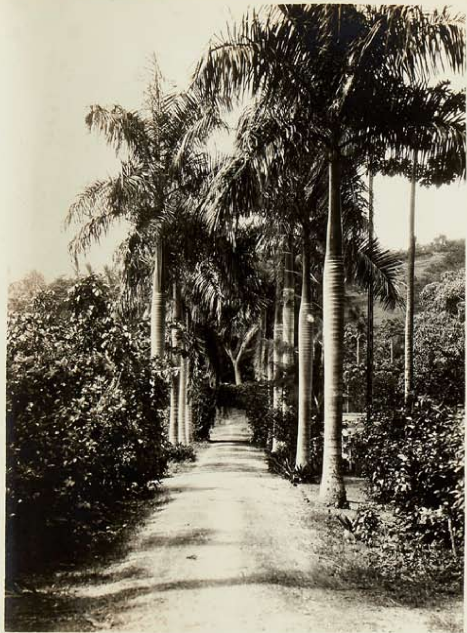
Royal Palm Drive Grenier's Palace Guam.