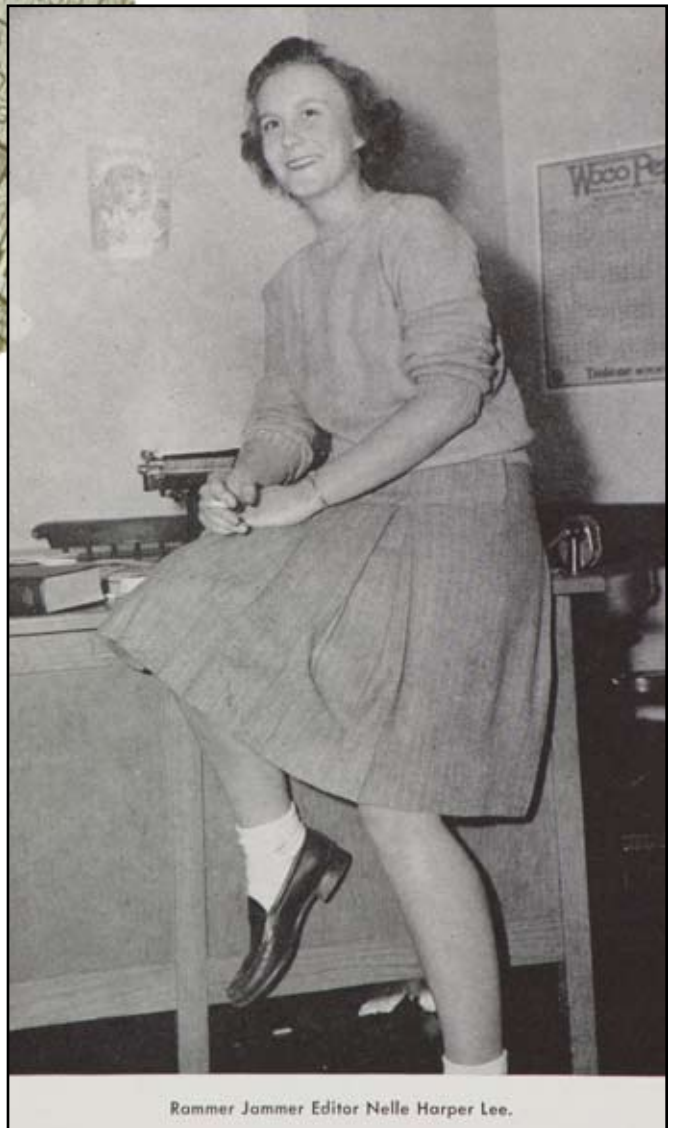
Rammer Jommer Editor Nelle Harper Lee.