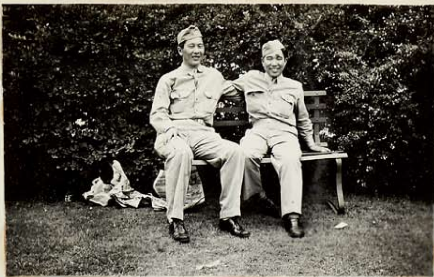
AT FT. WORTH, TEX. JULY 4, 1942