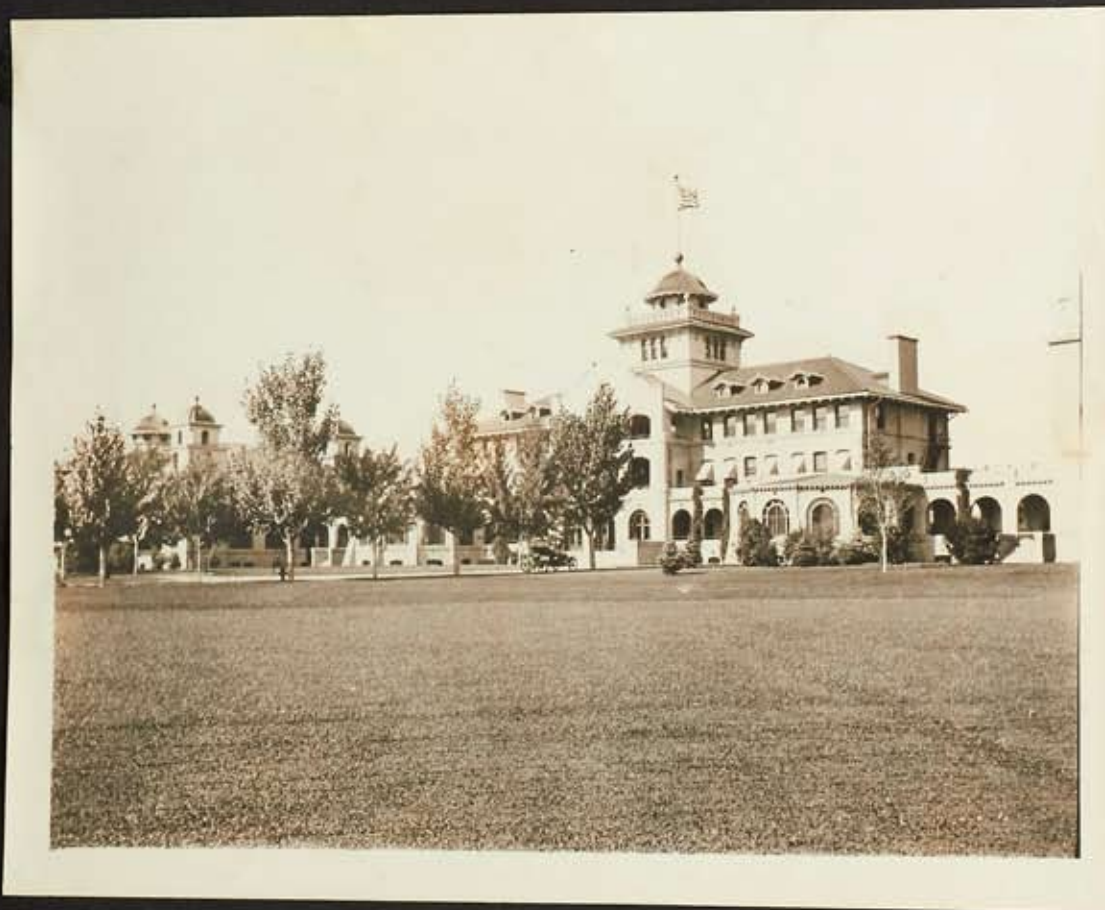
Agnes Memorial Sanatorium. Denver, Colo.

The photographs are mostly captioned and show the facilities buildings, staff, and patients. A number of the photographs show patients engaged in recreation including shooting, billiards, Halloween festivities (some in blackface), and Christmas parties as well as resting and dining in bed. A fascinating archive of quality restorative medical care for the "White Plague." [BTC#399385]