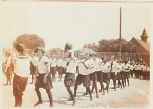
The ending of a hard game (we won)