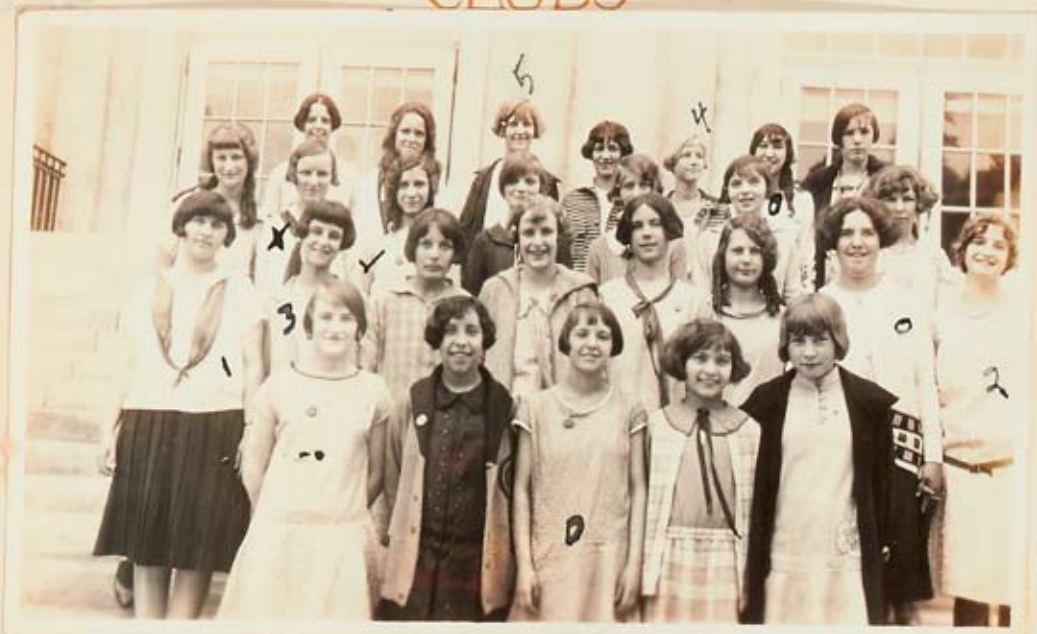
My Standard Office Club June to February, 1926 (turned around)