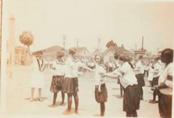
29 Over + under basket ball (we won)