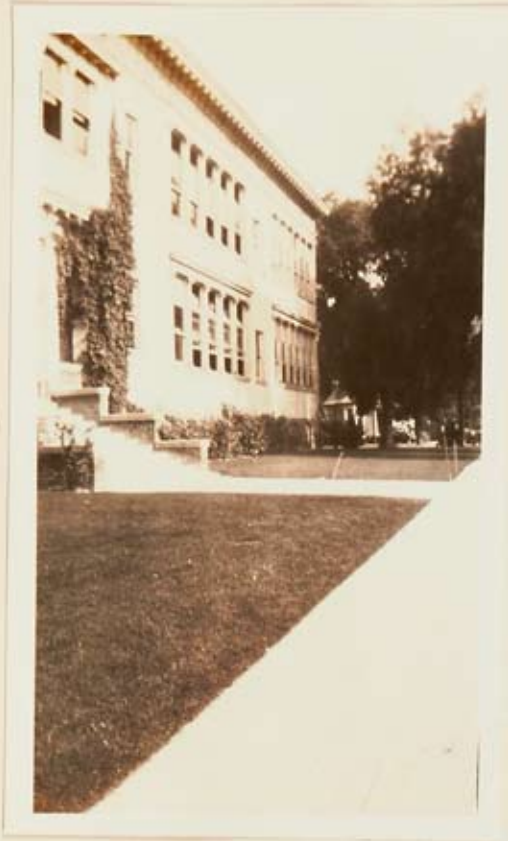
The Academy Building