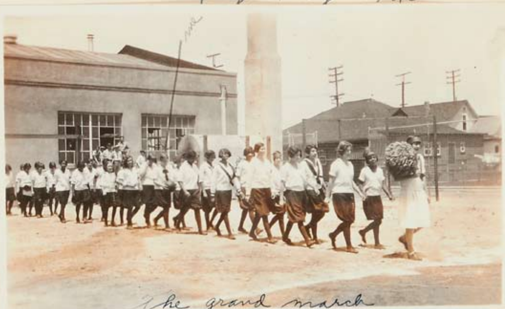
The grand march