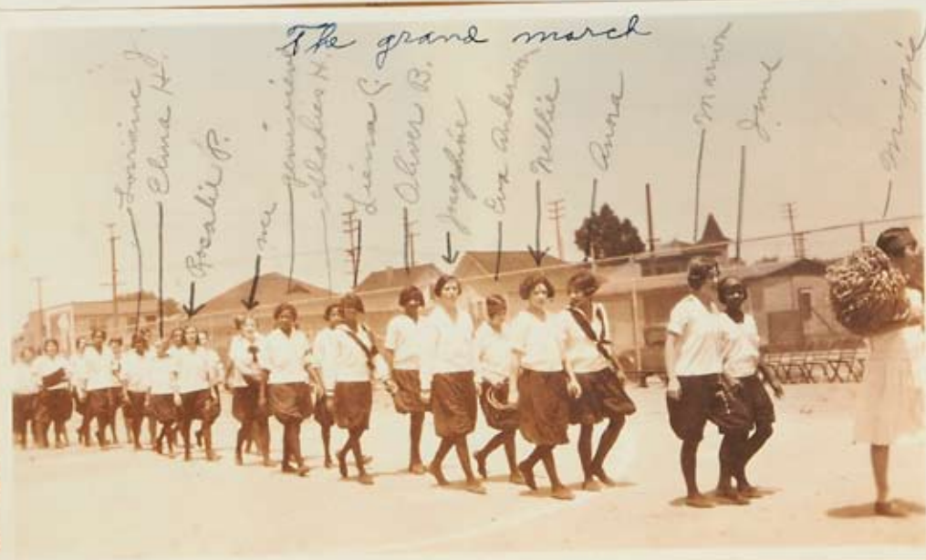
The grand march