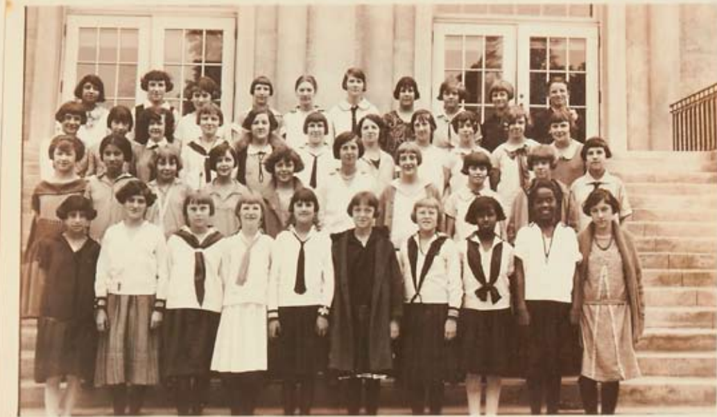
My Library Club of 1925. Feb. to June.