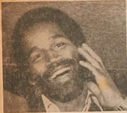
Buffalo's O.J. Simpson "Won't Ask for a Trade"