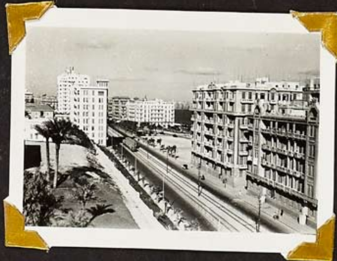
PUBLIC GARDENS, RAMLEH SQUARE ALEX.