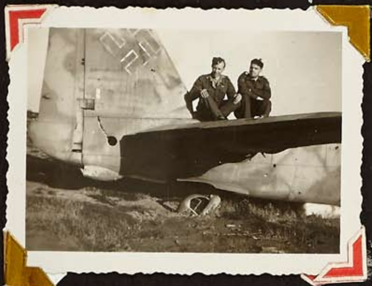
CATANIA AIRPORT. JAN. 44