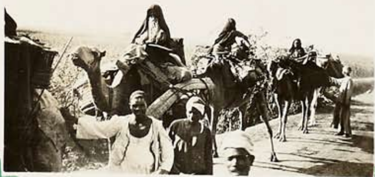
THE ROAD TO CAIRO!