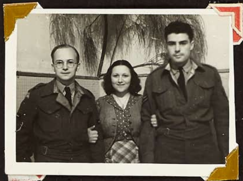
CATANIA AIRPORT. JAN 44