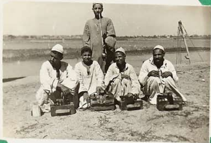
"SHINE YOUR SHOES, SIR?" CAIRO