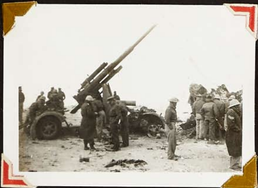
"SAAF. UNIT" WESTERN DESERT!