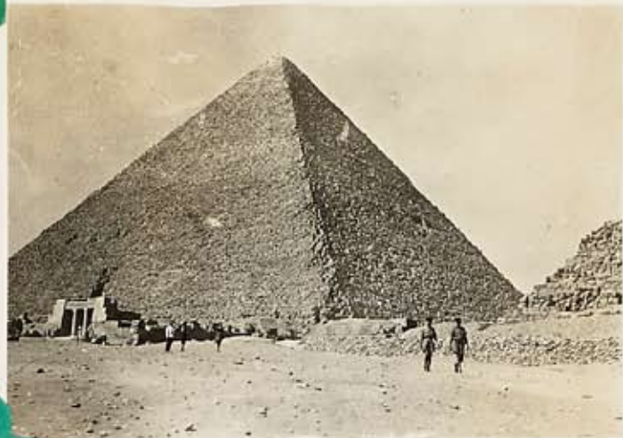
THE PYRAMIDS OF GIZEH! CAIRO