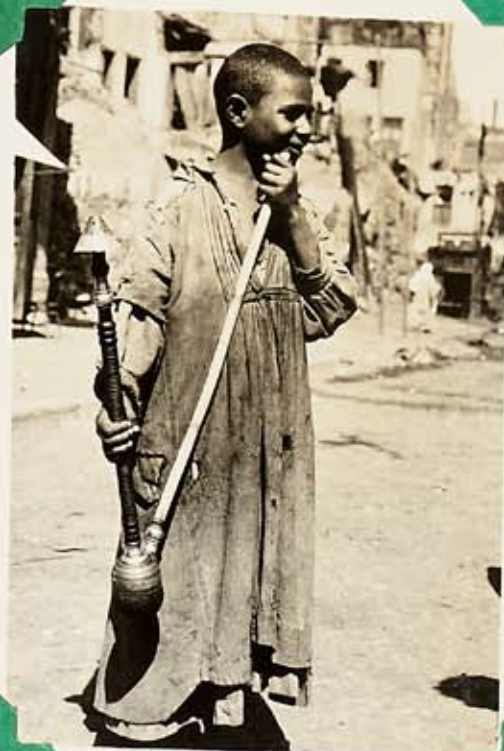
AN EGYPTIAN HUGLY-BUGLY PIPE!