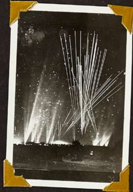
A. NIGHT ATTACK ON ALEX.

An album of images taken by a British soldier during World War II while stationed in Egypt, El Alemain, Tunis, Sousse, Sfax, Pont Du Fans, Cantania Sicily, and others between 1942-1945. Pictured throughout the album are photos of the cities, the pyramids, the Sphinx of Africa, ancient forts, and the harbor of Algiers. There are also numerous military pictures including a night attack on Alexandria with anti-aircraft fire captured on film like a fireworks display. One page shows two German grave sites and a group of captured Germans at El-Alemain as well as an overturned tank. Seven photos show men with various planes taken at Sousse Airfield; one photo is captioned, "enemy plane hit by ack-ack." Sousse was an airfield used during 1943 and controlled by the United States, mostly home to fighters and spitfires. An excellent collection of military photographs from an important WWII campaign. [BTC#394518]