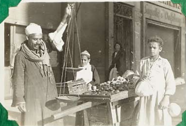
EGYPTIAN FRUIT VENDOR IN CAIRO!