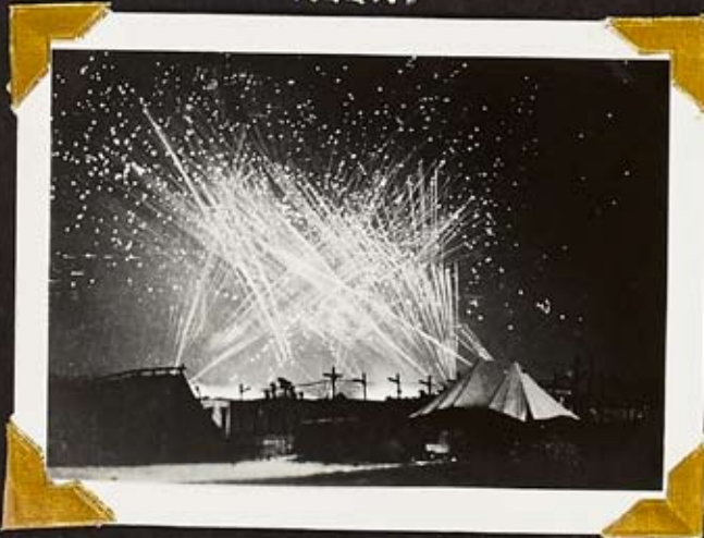
ANTI AIRCRAFT FIRE OVER ALEX.