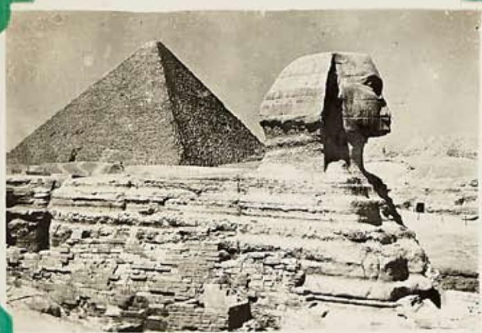
"THE SPHINX" CAIRO