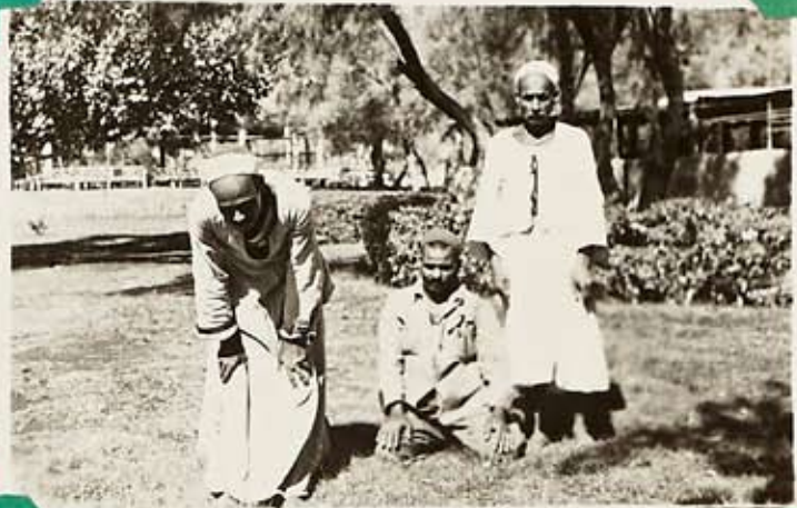
ARABS PRAYING IN THE PARK AT CAIRO!