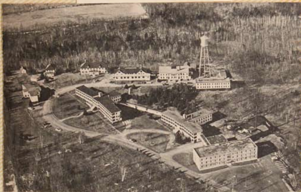
Aerial View taken after 1955