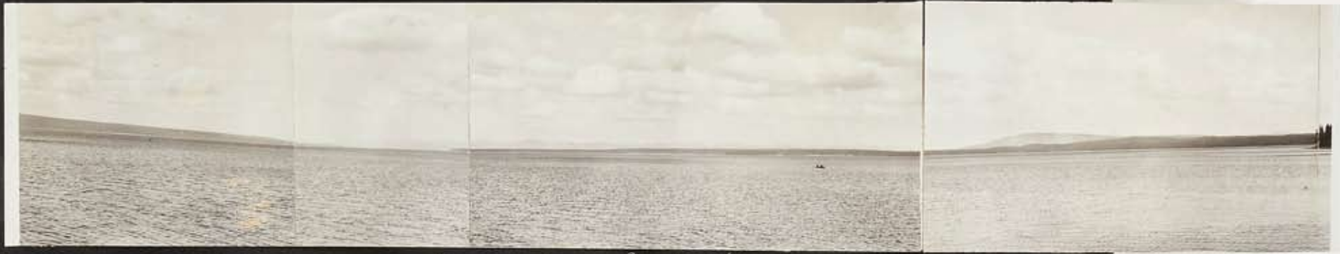
Panorama from wharf, West Thumb.

Mulloy's expeditions also took him to the midwest including a short stay in Montana en route to Yellowstone National Park. In over 100 photographs Yellowstone is depicted in all its glory from the "Paint Pots" to Old Faithful "in action." There are images of Artist's Point, the Great Falls, and various wildlife including a buffalo and a bear captioned, "the holdup near." Within the album are two panoramas from the geyser basin of West Thumb and of the wharf, as well as a photograph of a Native American in full regalia captioned "one of the originals." A wonderful collection of photographs with an emphasis on Yellowstone. [BTC#393297]