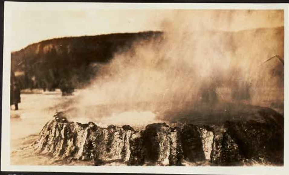
#22. Patch bowl - with its multi-colored rim.