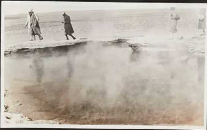
One of many hot springs at lake's edge. West Thumb.