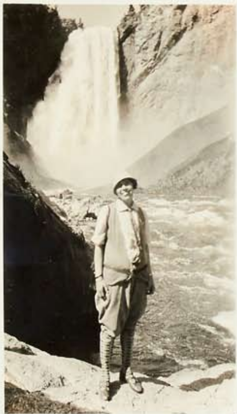
One of the party who took the following.