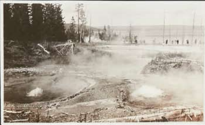
West Thumb boilers.