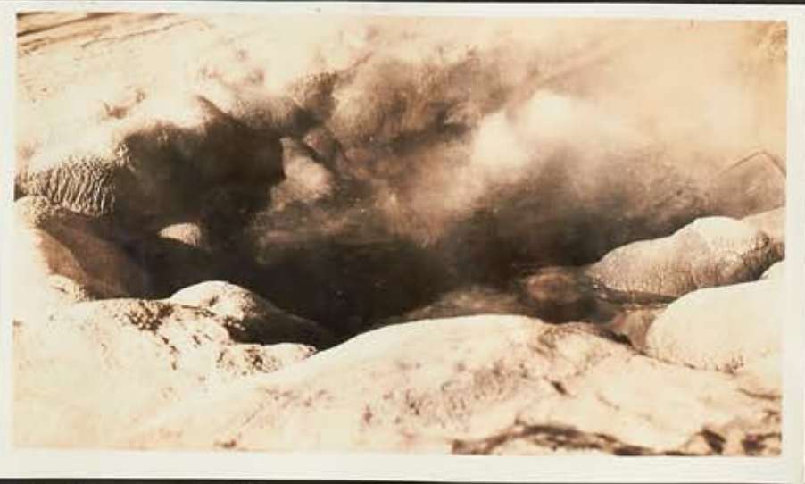
#3 One of a thousand nameless such. Geyser quiescent - merely a boiling spring.