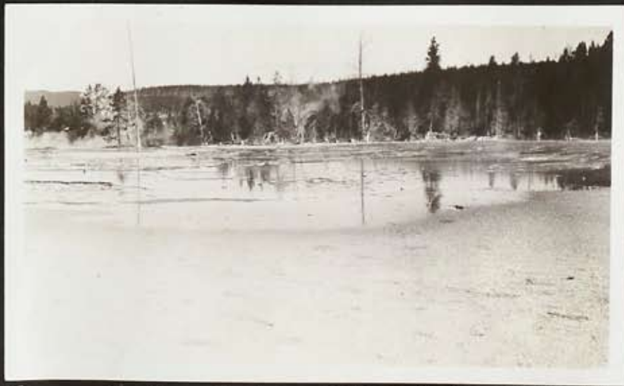
#2 The Three Sisters betray their guise in reflection!