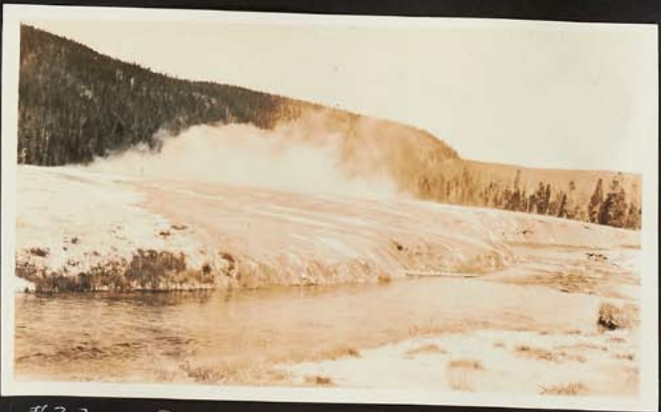
#23. Sunset Lake derives its name from vari-colored algal growths.