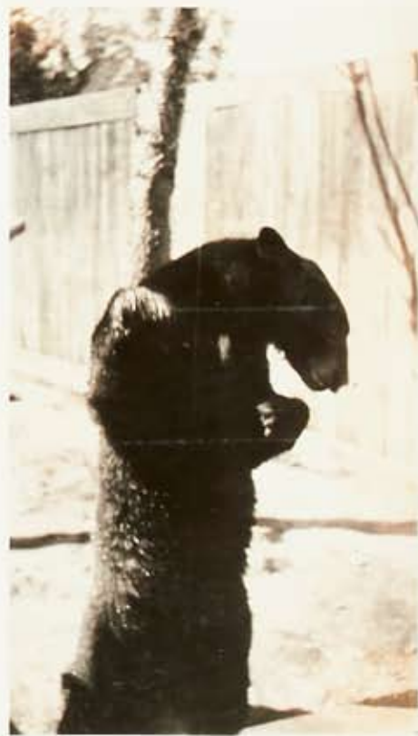
One of Mammoth pets - at the pole.