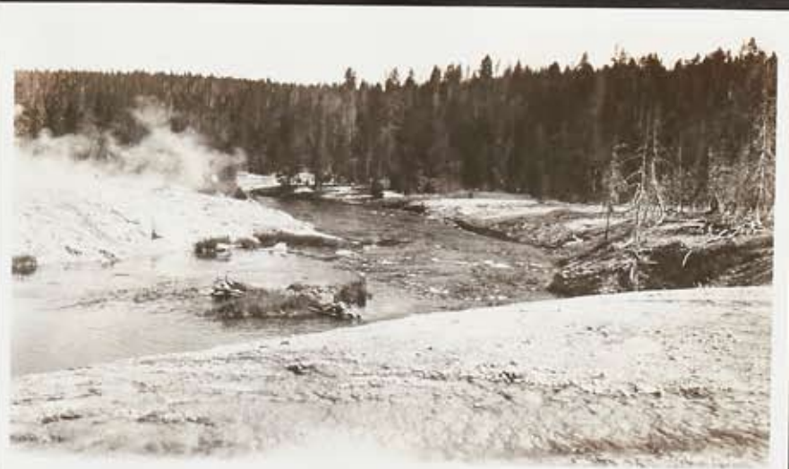
O.F. #1 Firehole - ever beautiful always changing. Nov. 1-24