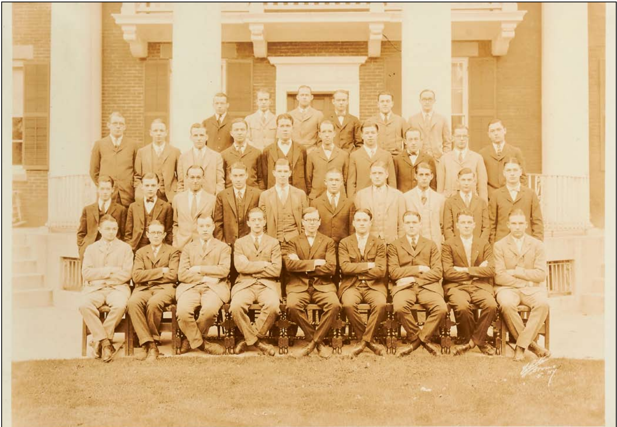
House ~ 1923-24.