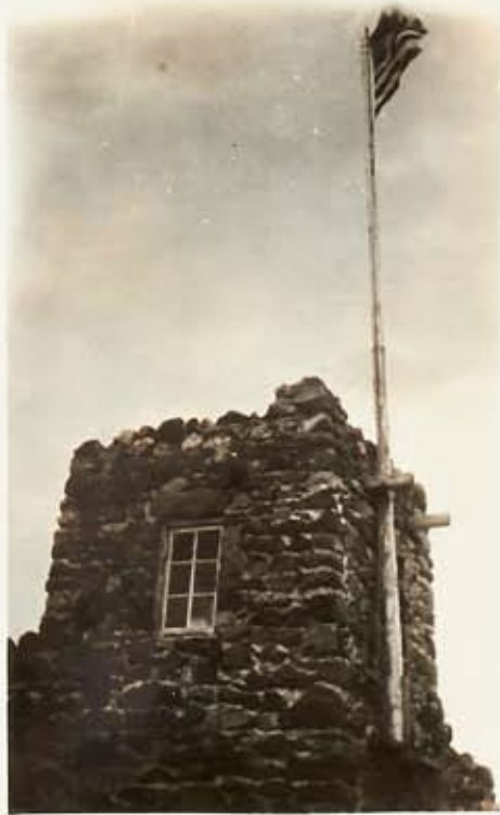
Top of ranger station - Summit Mt + Washburn