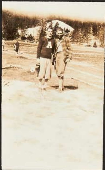
#24. Pair of Bills in shadow of white Pyramid - extinct geyser cone.