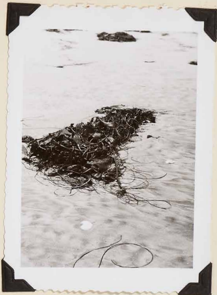
Dendroster and seaweed on the beach - Silver Strand State Park, San Diego, Cal.