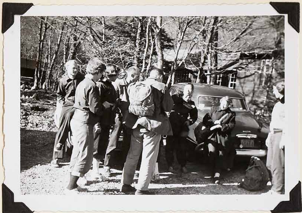
About to start up the fire trail in Tuckerman's Ravine: