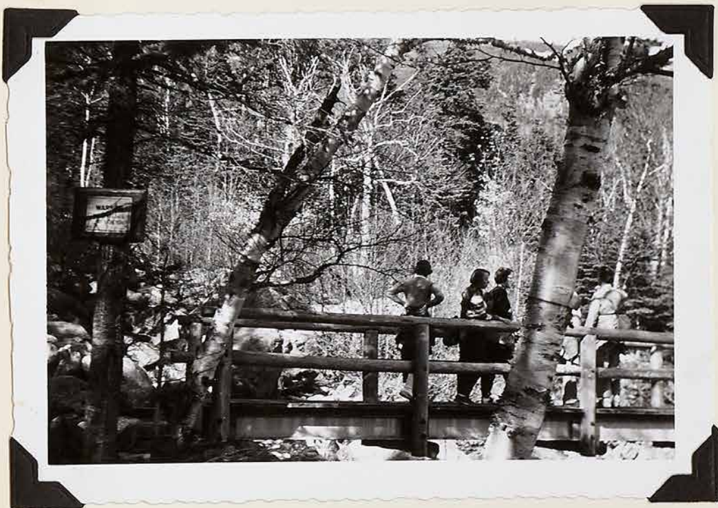
Across the Cutler River on the fire trail in Tuckerman's Ravine