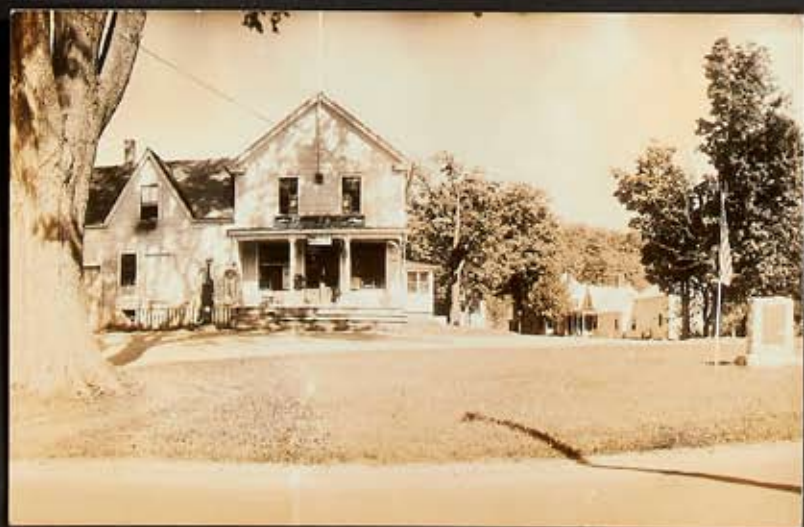
President Coolidge Birthplace