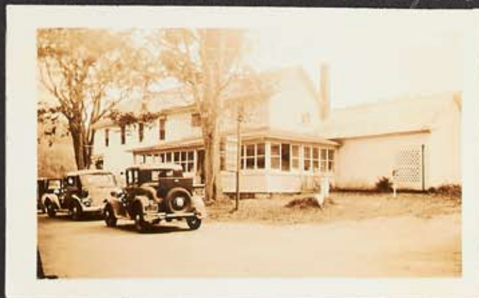
He was born in this house Plymouth Vermont