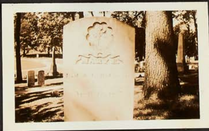
Spared to us Eighteen Sweet Years Then God took Her to Himself