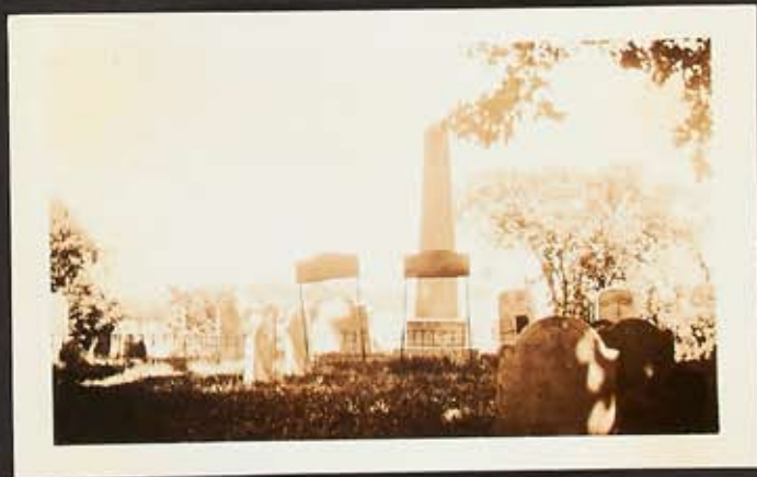
Governor Bradford's Grave