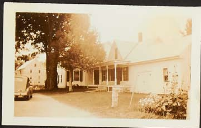
His Father's Home