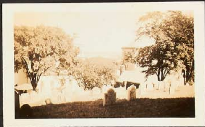
The Burial Hill Plymouth Mass