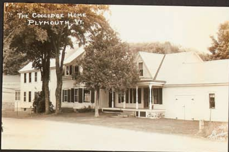
Calvin Coolidge was born in as President of U.S.A. in the room between the small room and the two lounge ones